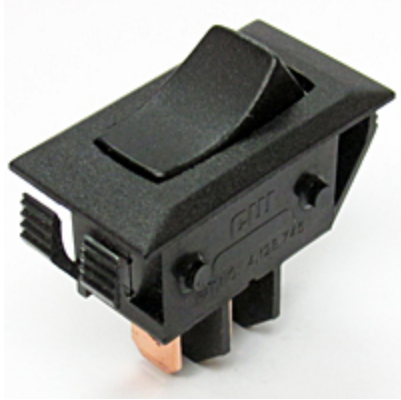
Item # GRS-2011B-3004, 2000 Series Momentary Full Size Rocker Switches

Email: info@cwind.com • Website: http://www.cwind.com