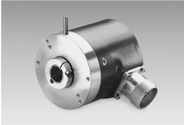
GBP5H with hollow shaft