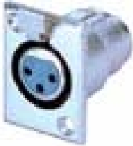
Model 5113A XLR (F) 3-pin rectangular flanged mount

Protect contacts and absorb vibrations in your audio applications