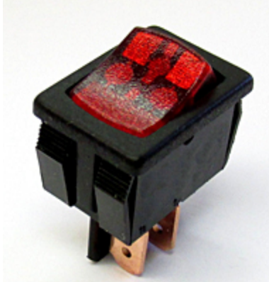
Item # GRL-4011-0000, 4000 Series Illuminated Miniature Rocker Switches

Email: info@cwind.com • Website: http://www.cwind.com