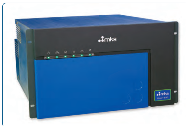
Cirrus 3-XD 6U rack-mount configuration