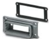
D-SUB panel mounting frame, shell size 2, IP67 degree of protection

D-SUB panel mounting frames - VS-15-A - 1688036