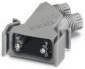
D-SUB sleeve housing, shell size 2, IP67 degree of protection

D-SUB sleeve housings - VS-15-T-2PG11 - 1688052