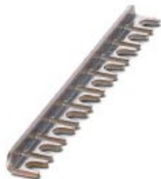
Fixed bridge, number of positions: 10, color: silver

Please be informed that the data shown in this PDF Document is generated from our Online Catalog. Please find the complete data in the user's documentation. Our General Terms of Use for Downloads are valid ( http://phoenixcontact.com/download )