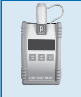
Optical Power Meter Battery-Operated