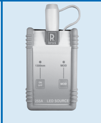
LED Source Battery-Operated