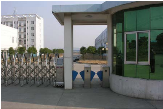
Access control security management