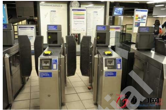
metro access management