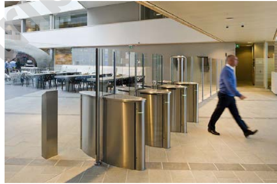
airport security management.