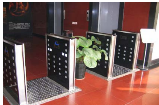
Construction site access management