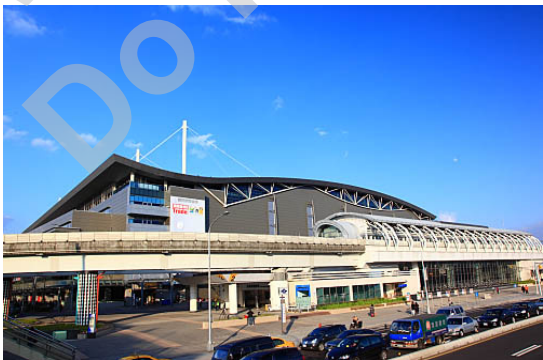
Exhibition Staff Access System