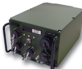
RF-7800W-AA001 Power Control Unit