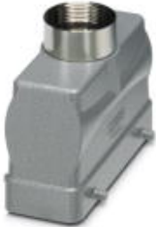
HEAVYCON B24 sleeve housing, for double locking latch, height: 65 mm, with 1 x Pg29 gland, straight cable outlet

Please be informed that the data shown in this PDF Document is generated from our Online Catalog. Please find the complete data in the user's documentation. Our General Terms of Use for Downloads are valid ( http://phoenixcontact.com/download )