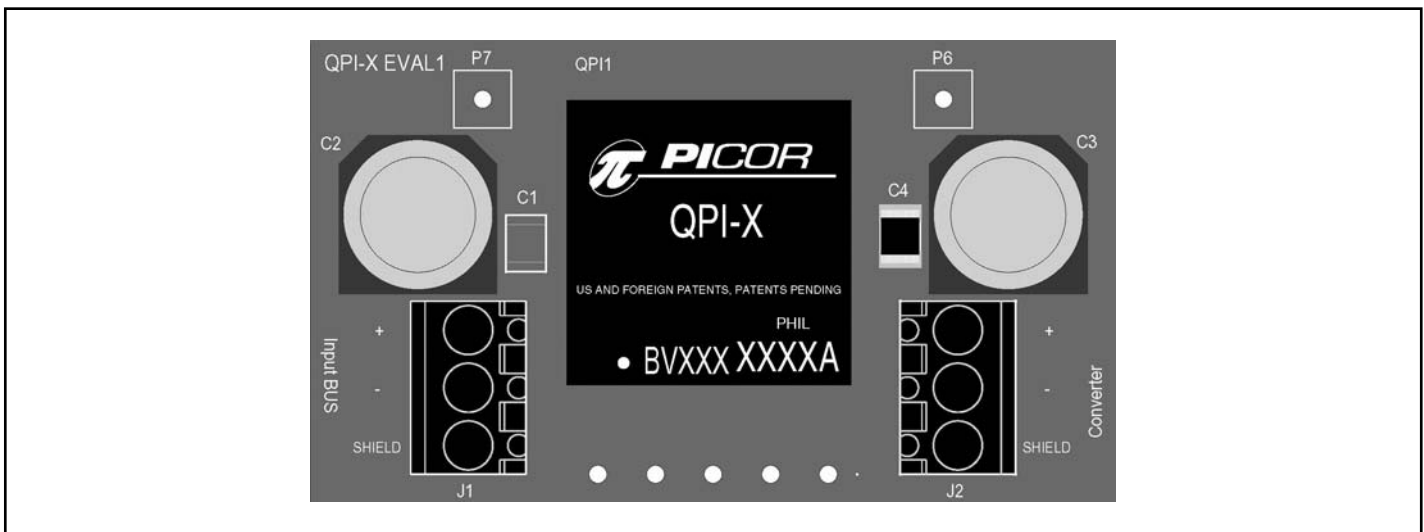
Figure 3 - QPI-X EVAL board showing location of components and connectors.