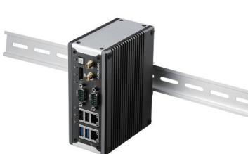
DIN Rail support

The MXE-210 series presents an intelligent, robust embedded system supporting wide application development and easy service deployment, for outstanding performance in Intelligent Transportation, Facility Management, Industrial Automation, and Internet of Things (IoT) applications.