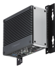
Wall Mounting support (Optional)