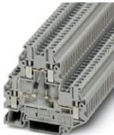
Component terminal block, with integrated diode, connection method: Screw connection, cross section: 0.14 mm 2 - 4 mm 2 , AWG: 26 - 12, width: 5.2 mm, color: gray, mounting type: NS 35/7,5, NS 35/15

Please be informed that the data shown in this PDF Document is generated from our Online Catalog. Please find the complete data in the user's documentation. Our General Terms of Use for Downloads are valid ( http://phoenixcontact.com/download )