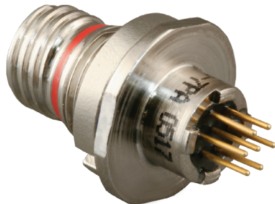
Series 801 Printed Circuit Board Receptacle

These receptacles feature a low profile shell for minimum protrusion inside enclosures. Contacts are non-removable. Connectors are backfilled with epoxy for a watertight seal.