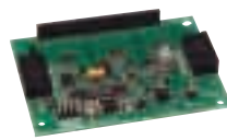
SYNC-1 Accessory Card