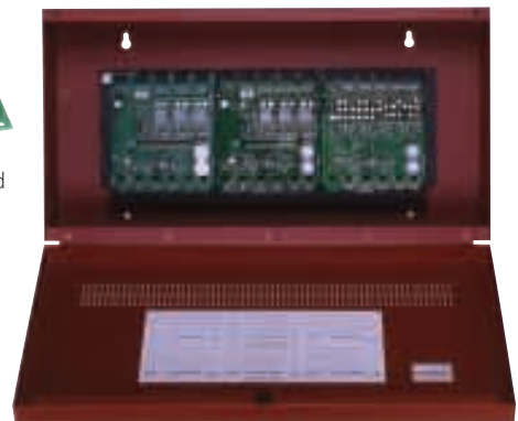
BB-6 Enclosure with CH-6 Chassis