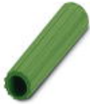
Insulating sleeve, Color: green