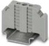
End clamp, width: 9.5 mm, color: gray