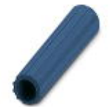
Insulating sleeve, Color: blue