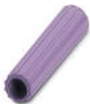
Insulating sleeve, Color: violet