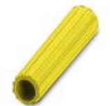
Insulating sleeve, Color: yellow