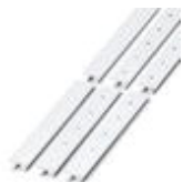
Zack marker strip, Can be ordered: Strip, white, Labeled according to customer specifications, Mounting type: Snap into tall marker groove, For terminal block width: 16.3 mm, Lettering field: 10.5 x 16.25 mm