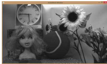
Camera Tool view mode