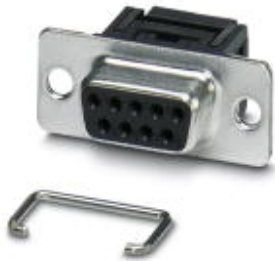
D-SUB contact insert, shell size 1, with nine signal contacts, contact type socket, flat-ribbon cable connection, angled, fixing with a 3 mm hole, for panel mounting frame VS-09-...

Please be informed that the data shown in this PDF Document is generated from our Online Catalog. Please find the complete data in the user's documentation. Our General Terms of Use for Downloads are valid ( http://phoenixcontact.com/download )