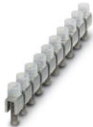
Fixed bridge, Number of positions: 10, Color: silver

Please be informed that the data shown in this PDF Document is generated from our Online Catalog. Please find the complete data in the user's documentation. Our General Terms of Use for Downloads are valid ( http://download.phoenixcontact.com )