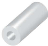
R30-500 Brass, Circular M3, Ø4.76mm O/D