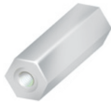
R30-100 Brass, Hexagonal M3, 5.0mm A/F