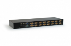
KCM-1632 16-Port KVM Switch Module

No liability or responsibility for any errors or omissions in the content. Specifications are subject to change without notice. All mentioned brand names are registered trademarks and property of their owners. Copyright © Digital Data Communications GmbH, Germany. All Rights Reserved.