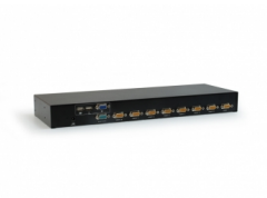
KCM-0832 8-Port KVM Switch Module