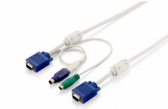
ACC-2101 1.8m PS/2 and USB KVM Cable