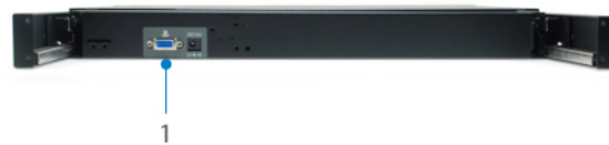
1. KCM Moudule Connector