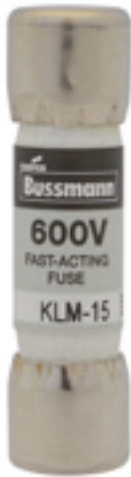
600Vac/dc 1 to 30A