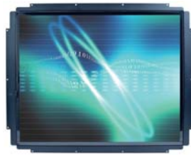
Open Frame Type