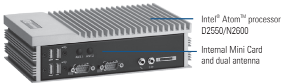
▲ Front view

Fanless Embedded System with Intel® Atom™ Processor N2600 1.6 GHz or D2550 1.86 GHz, VGA and DisplayPort, 2 GbE LAN, 6 USB and 4 COM