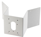
CAS-2402 Corner mount