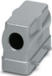
HEAVYCON B16 sleeve housing, for double locking latch, height: 65 mm, with 1 x M25 thread, lateral cable outlet

Please be informed that the data shown in this PDF Document is generated from our Online Catalog. Please find the complete data in the user's documentation. Our General Terms of Use for Downloads are valid ( http://phoenixcontact.com/download )