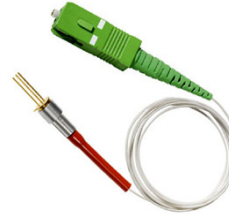
PD100-003-3xx SC/APC Pigtail