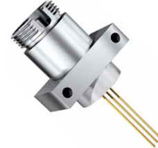
PD100-003-5xx FC Receptacle