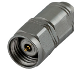
CASE STYLE: LL2587