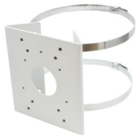
CAS-2504 Pole Mount

No liability or responsibility for any errors or omissions in the content. Specifications are subject to change without notice. All mentioned brand names are registered trademarks and property of their owners. Copyright © Digital Data Communications GmbH, Germany. All Rights Reserved.