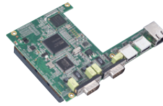
MIO-6260 Multi I/O Module with 1 Ethernet, 2 COM, 4 USB