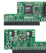
PCM-233C IDE (44-pin) to SATA Converter Module