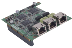
MIO-6250 3 x 10/100 Mbps with Bypass Ethernet Ports