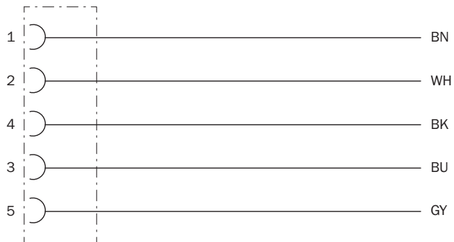
Contact assignment of the M12 female connector