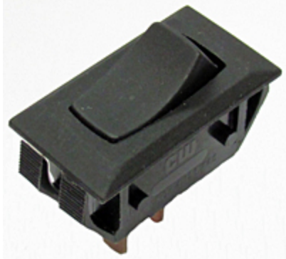
Item # GRS-2011-2003, 2000 Series Maintained Action Full Size Rocker Switches

Email: info@cwind.com • Website: http://www.cwind.com