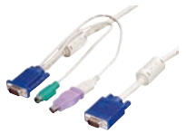
ACC-2103 PS/2 and USB Cable KVM 5.0m