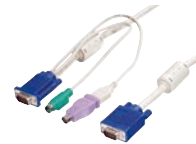
ACC-2102 PS/2 and USB Cable KVM 3.0m