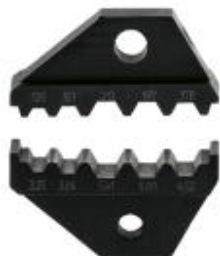
Spare die for CRIMPFOX-FO 5,41

Please be informed that the data shown in this PDF Document is generated from our Online Catalog. Please find the complete data in the user's documentation. Our General Terms of Use for Downloads are valid ( http://download.phoenixcontact.com )