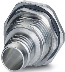
M8 pin, rear mounting

Please be informed that the data shown in this PDF Document is generated from our Online Catalog. Please find the complete data in the user's documentation. Our General Terms of Use for Downloads are valid ( http://phoenixcontact.com/download )