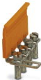
Switching jumper, pitch: 8.2 mm, number of positions: 4, color: silver

Please be informed that the data shown in this PDF Document is generated from our Online Catalog. Please find the complete data in the user's documentation. Our General Terms of Use for Downloads are valid ( http://phoenixcontact.com/download )