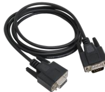
DB9M to DB9F