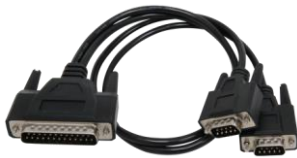
DB25M to DB9Mx2