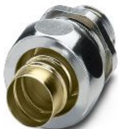
Cable gland made from brass with metric thread, IP40 protection

Please be informed that the data shown in this PDF Document is generated from our Online Catalog. Please find the complete data in the user's documentation. Our General Terms of Use for Downloads are valid ( http://phoenixcontact.com/download )