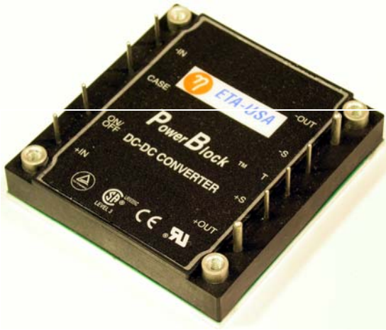
Size: 60.70mm x 57.91mm x 13.30mm (2.39in. x 2.28in. x 0.52in.)