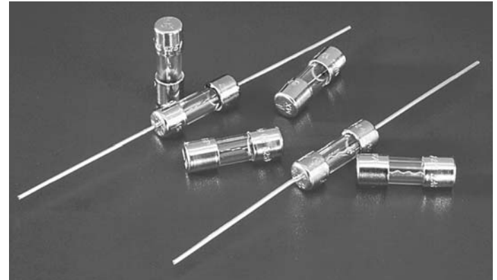
225 000 Series

Contact Littelfuse concerning other ampere ratings.