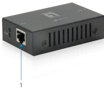
1. RJ-45 PoE In

For system integrators looking for a professional solution to help extend their PoE network, POR-0101 is the perfect accessory to increase your Power over Ethernet network performance. LevelOne POR-0101, a 1-Port PoE Repeater requiring neither configuration nor electrical power, is an innovative transmitter to pass on both data and power extend to another 100 meters. The delivery though one PoE port and one non-PoE port are adequate to extend network devices such as WLAN Access Points, Network Cameras and other appliances with high-speed to the network for greater deployment flexibility.