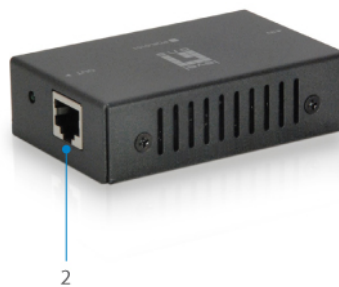
2. RJ-45 PoE Out