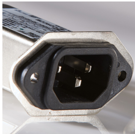
EJT Flanged EMI Filter