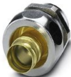
Cable gland made from brass with Pg thread, IP65 protection

Please be informed that the data shown in this PDF Document is generated from our Online Catalog. Please find the complete data in the user's documentation. Our General Terms of Use for Downloads are valid ( http://phoenixcontact.com/download )