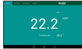
GPP / TEMPERATURE