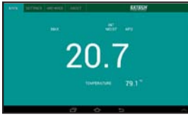
MOISTURE / TEMPERATURE