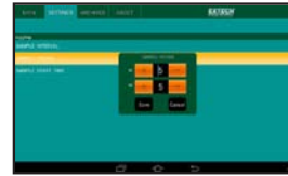
EASY TO NAVIGATE MENUS