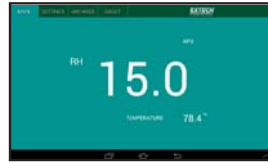
HUMIDITY / TEMPERATURE