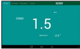
CONDENSATION / DEW POINT