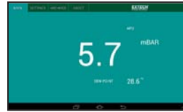
mBAR / TEMPERATURE