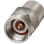
CASE STYLE: LL561