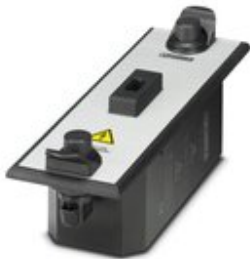
CHECKMASTER 2 test adapter for the CTM product range

Please be informed that the data shown in this PDF Document is generated from our Online Catalog. Please find the complete data in the user's documentation. Our General Terms of Use for Downloads are valid ( http://phoenixcontact.com/download )