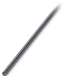
Return busbar, color: silver

Please be informed that the data shown in this PDF Document is generated from our Online Catalog. Please find the complete data in the user's documentation. Our General Terms of Use for Downloads are valid ( http://phoenixcontact.com/download )