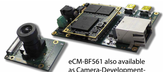
eCM-BF561 also available as Camera-Development-Kit (CDK)