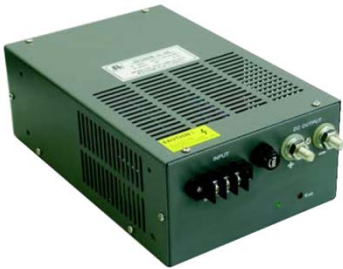
Size: 9.84in x 6.30in x 3.43in (250mm x 160mm x 87mm)